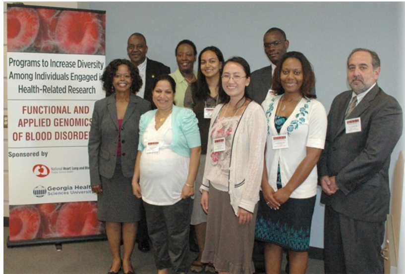
Cohort I Scholars—Summer Institute, 2011

During the GHSU Summer Institute, mentees learn how to access public databases established by the Human Genome Project and to perform basic data mining procedures. Mentees are provided fundamental hands-on bench research training by interdisciplinary faculty in the areas of genomics, cell and molecular biology and proteomics. Partnerships between mentees and mentors are established based on mutual research interests. Grant workshops are conducted by NHLBI staff to assist mentees in developing a research focus and identifying viable funding sources to promote a sustainable and independent research program.