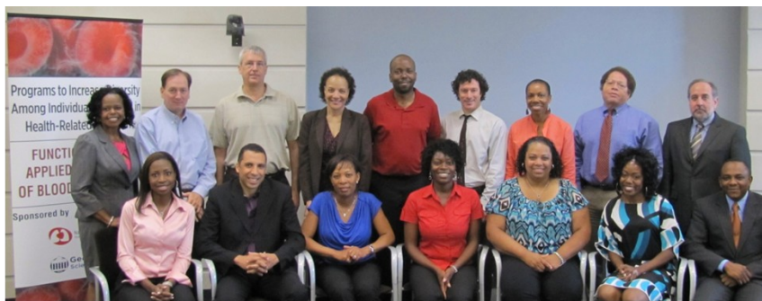
GHSU PRIDE 2012 Cohort 2 Mentees and Mentors

We are proud of their accomplishments and will continue to track their academic and career advancement success!